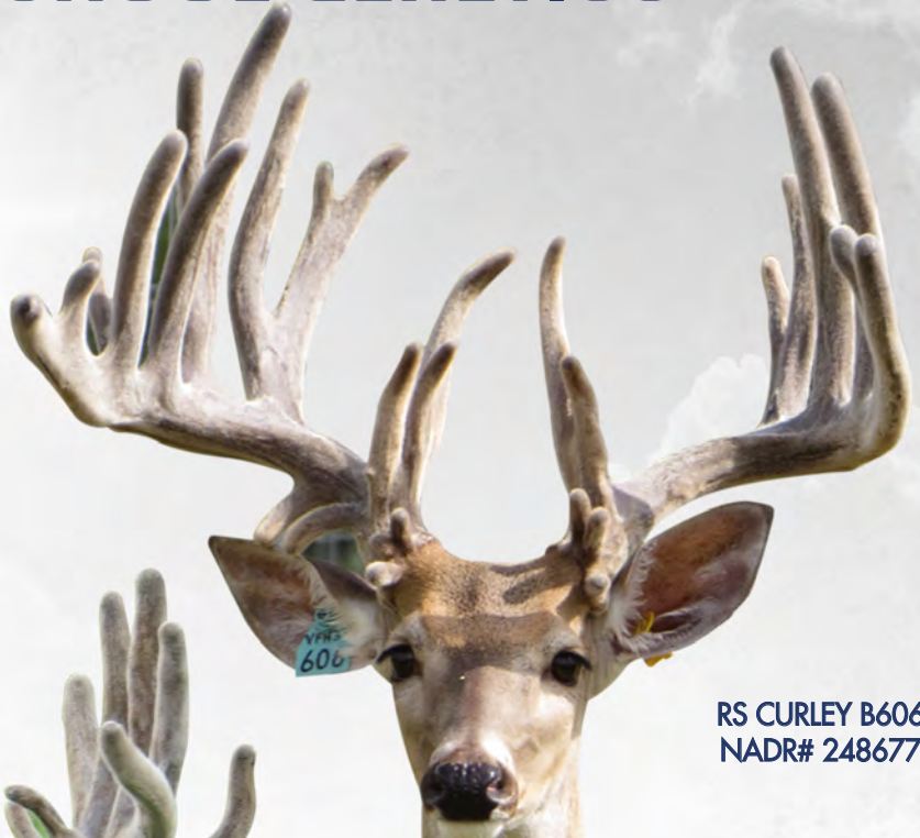
RS CURLEY B606 NADR# 248677