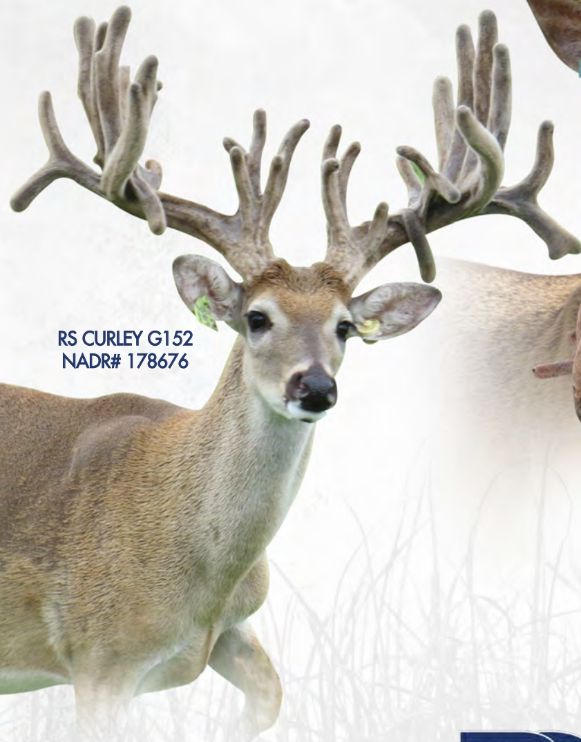
RS CURLEY G152 NADR# 178676